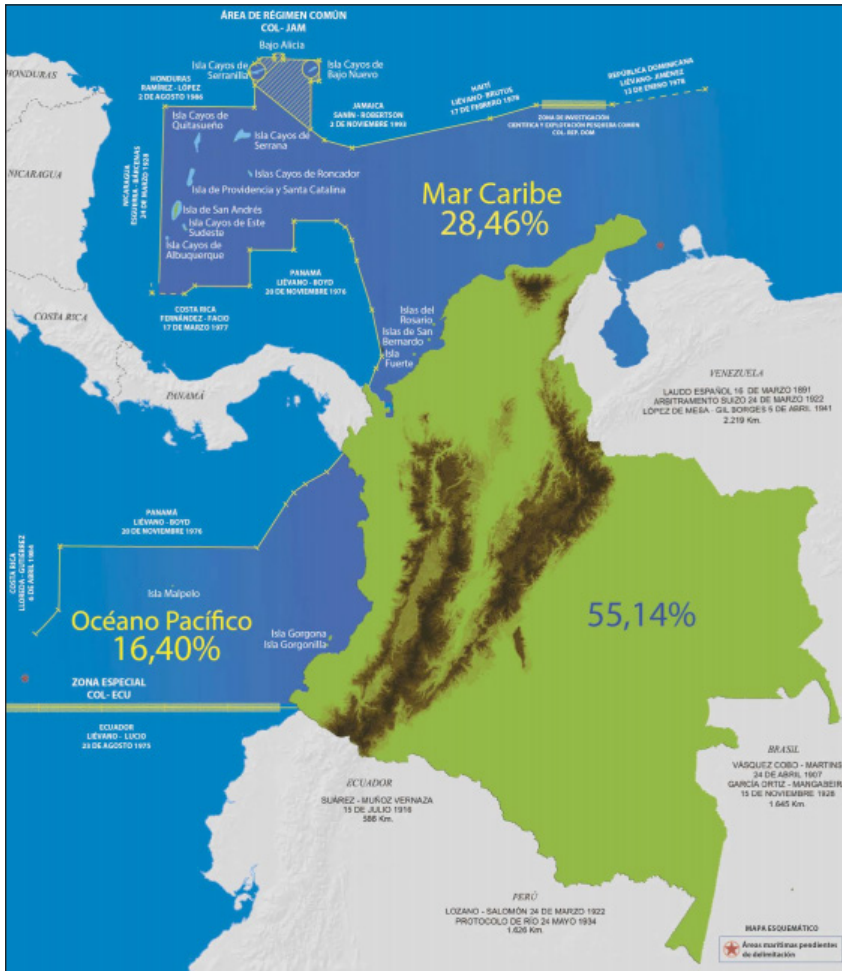
Figure 3. Colombian Maritime and terrestrial areas