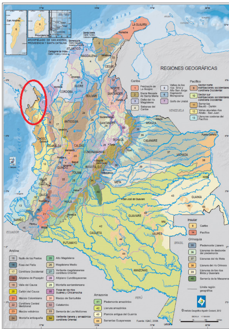
Figure 2. Colombia's geographical regions