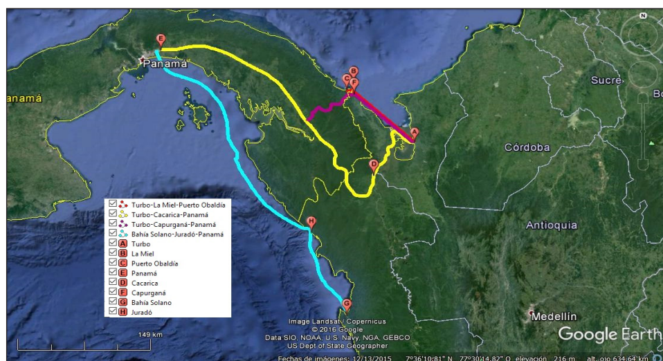
Figure 6. Illegal migration routes in the Darien region.