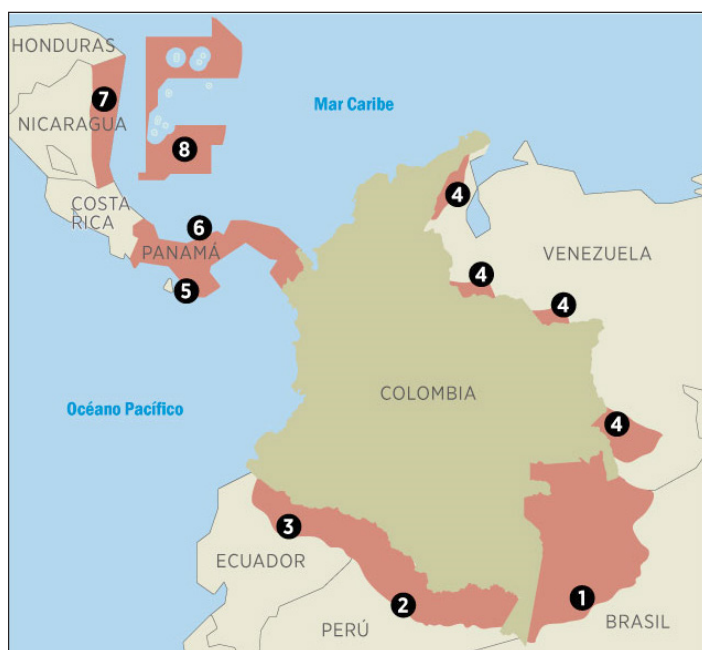
Figure 1. Territories granted by the Republic of Colombia