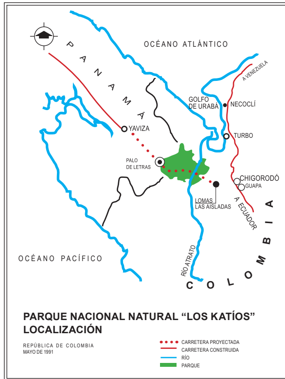
Figure 7. Pan-American Highway in the Darien region